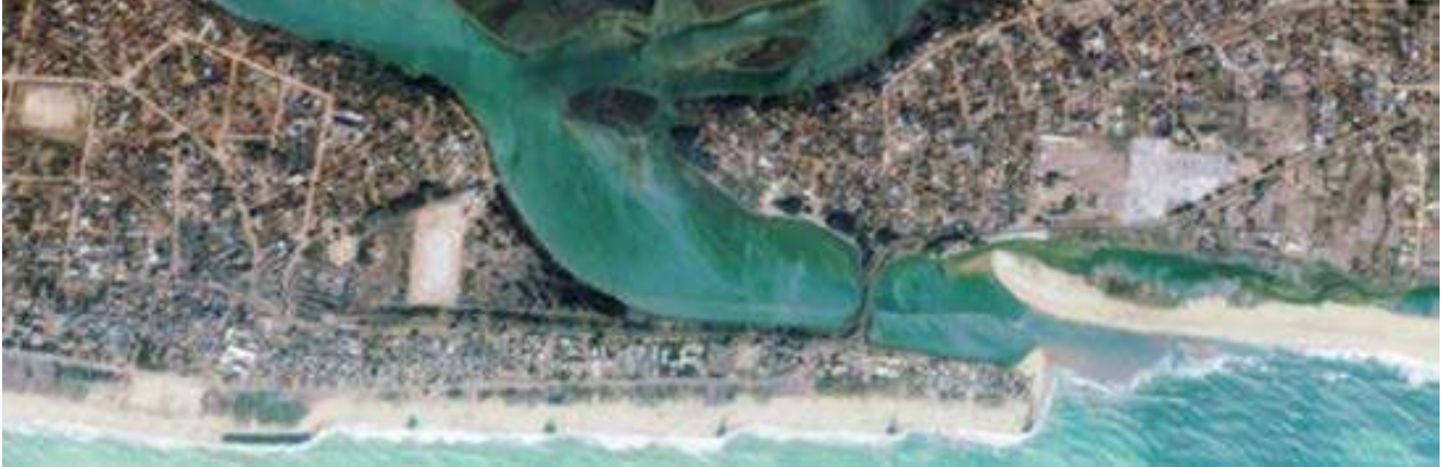
Aneho fluvio-marine system (the groynes and rock fill can be seen at the bottom of the picture.