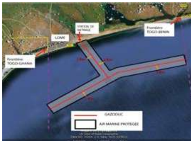
The West African Gas Pipeline, stretching from Nigeria to Takoradi port in Ghana, spans throughout the Togolese Coast. A marine protected area is being considered in the maritime exclusion zone of the infrastructure.