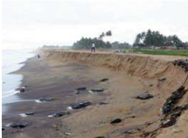
Micro-cliffs due to erosion in Aneho (MOLOA)