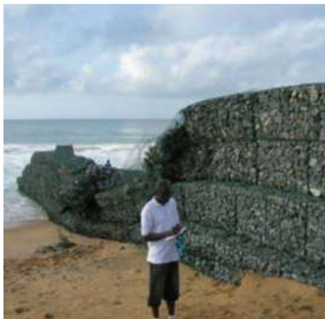
Wall materializing the border with Ghana