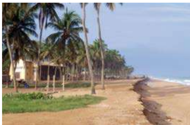
Erosion along the coastal segment of Agbodrafo (2013)