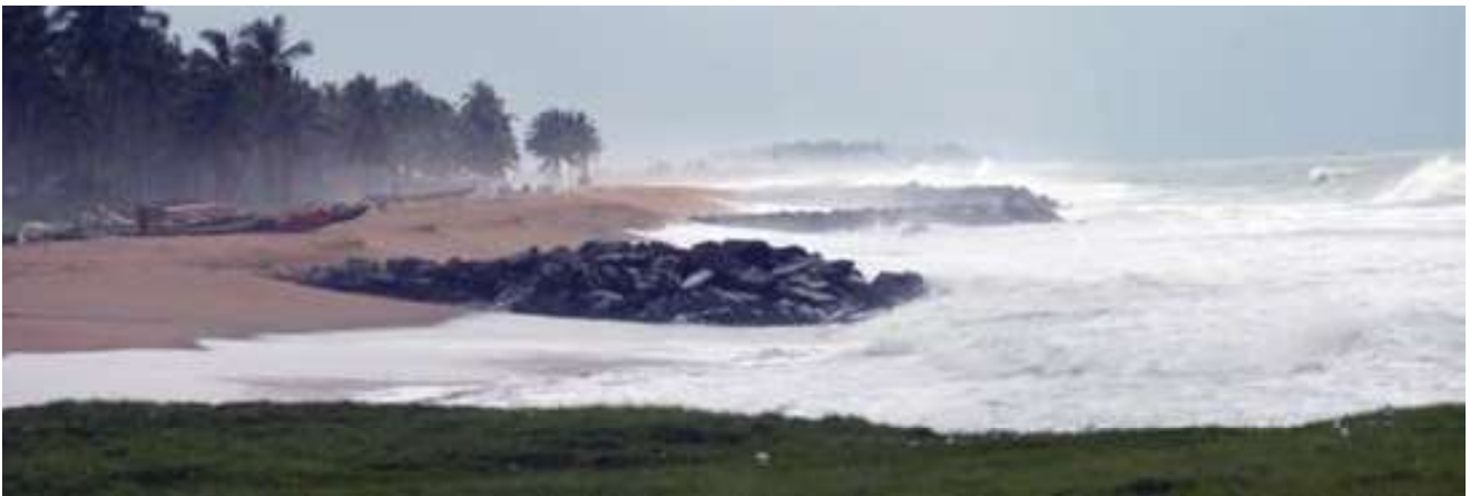
Groynes at Aneho