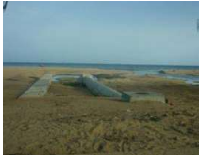
Discharge of wastewater on the beach