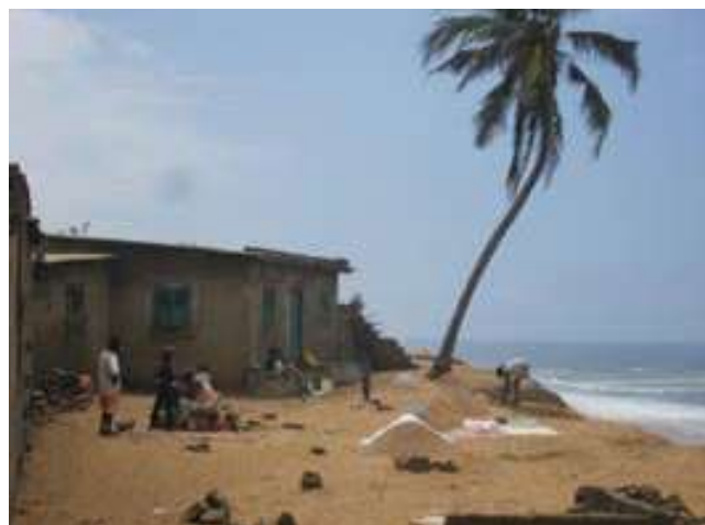
Coastal erosion in the east of the port of Lomé