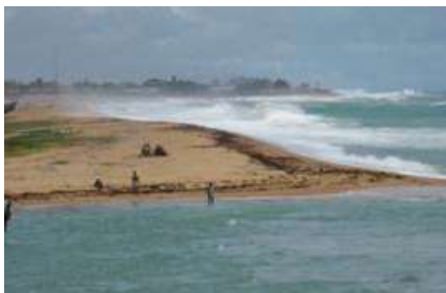
Break of the sandy spit at Aného