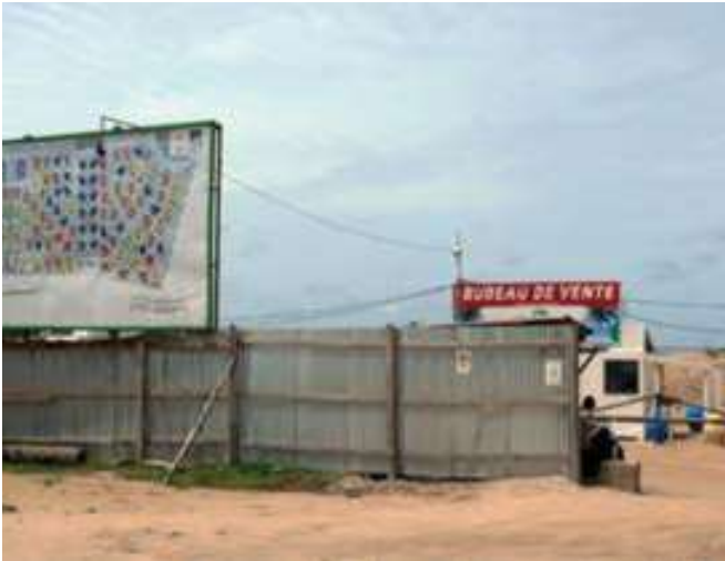
Lome : Housing development on the beach area undergoing accretion (West of the port)