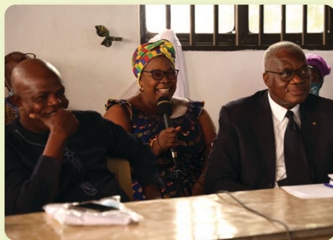
Community members of Aného, Togo, contribute to the radio show.

Radio du littoral broadcasts will continue to share stories of resilience, provide a feedback mechanism, and amplify the voices of communities, including those of women. The World Bank is exploring how stories and lessons resulting from radio shows could be further disseminated at the subregional level via the WACA website and social networks, or in partnership with print and online media outlets. To expand its reach, the radio's producers are also creating short videos of beneficiaries, online podcasts, and news stories.