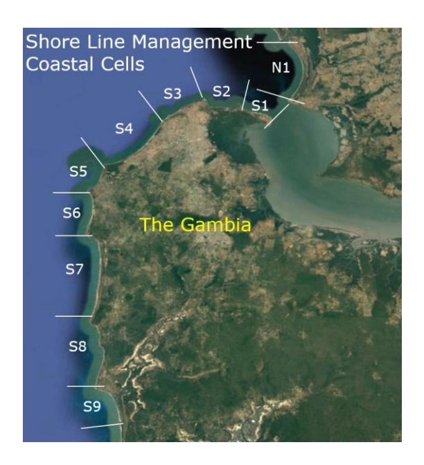
Coastal planning is a complicated process involving many stakeholders and many

complicated physical and ecological processes. The SMP is a powerful tool to guide and facilitate this planning process.