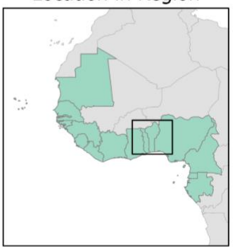
Location in Region

West Africa Regional Gap Analysis: Plastics Circularity