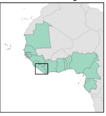
Location in Region

West Africa Regional Gap Analysis: Plastics Circularity