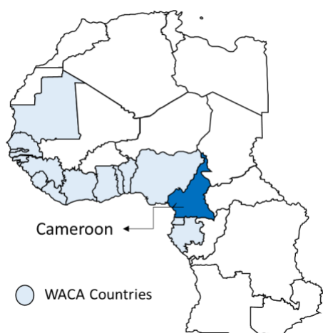
Map of African continent