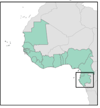
Location in Region

West Africa Regional Gap Analysis: Plastics Circularity