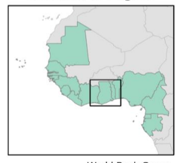
World Bank Group