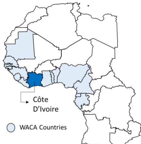
Map of African continent