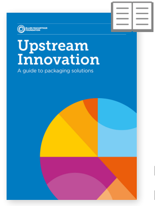
Nov 2020 Download the report here