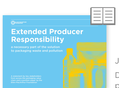
Jun 2021 Download the position paper here