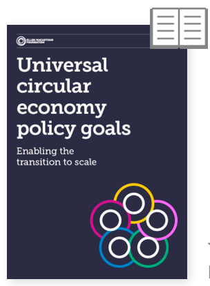
Jan 2021 Download the report here