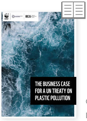
Oct 2020 Download the report here