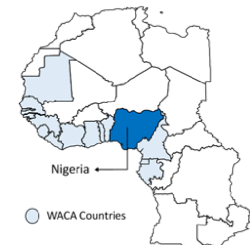
Map of African continent