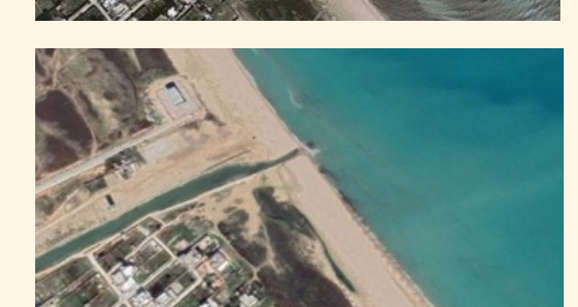
Figure 4: Municipal wastewater from the El Khelij drainage canal, north of Tunis, in 2015 (top) and after 2020 (bottom). Piping wastewater under land and sea has proven to be visibly better for the environment.

The project also supports improved water-guality monitoring and promotes the reuse of treated wastewater for farming and urban spaces.