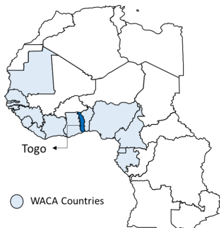
Map of African continent