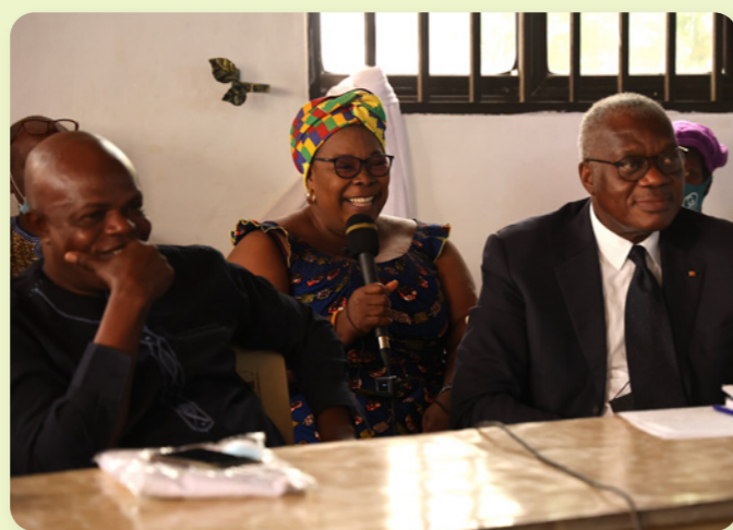
Community members of Aného, Togo, contribute to the radio show.

Radio du littoral broadcasts will continue to share stories of resilience, provide a feedback mechanism, and amplify the voices of communities, including those of women. The World Bank is exploring how stories and lessons resulting from radio shows could be further disseminated at the subregional level via the WACA website and social networks, or in partnership with print and online media outlets. To expand its reach, the radio's producers are also creating short videos of beneficiaries, online podcasts, and news stories.