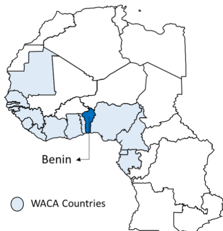
Map of African continent