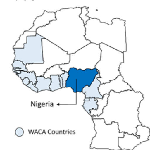
Map of African continent