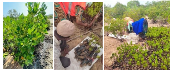
Community participation in mangrove restoration efforts in Kenya.