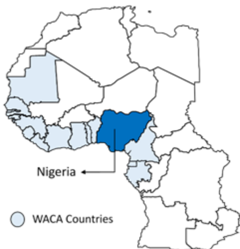
Map of African continent