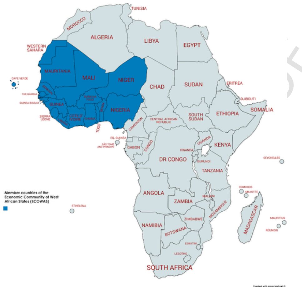
Fig. 1. Map of Africa indicating the 16 member countries of Economic Community of West African States (ECOWAS).

The region covers an estimated 5,112,903 km 2 with a population of about 382.2 million, making it the second-most populous sub-region in Africa [25]. Almost half of West Africa's population (47.3%) lives in urban areas with high rates of population growth, urbanisation and a growing middle class [25]. These characteristics underscore the region's high patronage of plastic products. Increasingly, the traditional forms of packaging have been replaced with plastic packaging products [13].